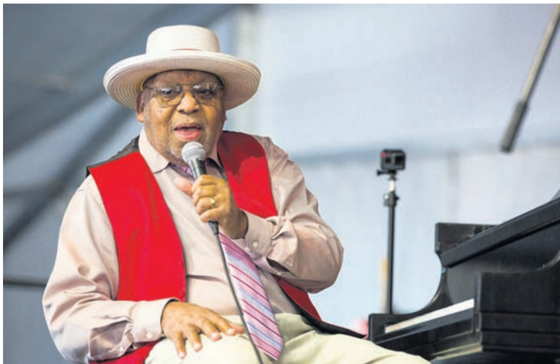
This April 28, 2019, file photo, shows Ellis Marsalis during the New Orleans Jazz & Heritage Festival in New Orleans. New Orleans Mayor LaToya Cantrell announced Wednesday, April 1, 2020, that Marsalis has died. He was 85.

By J. McCONNAUGHEY and REBECCA SANTANA NEW ORLEANS (AP) — Ellis Marsalis Jr., the jazz pianist, teacher and patriarch of a New Orleans musical clan, died late Wednesday from pneumonia brought on by the new coronavirus, leaving six sons and a deep legacy. He was 85. "My dad was a giant of a musician and teacher, but an even greater father. He poured everything he had into making us the best of what we could be," Branford said. Four of the jazz patriarch's